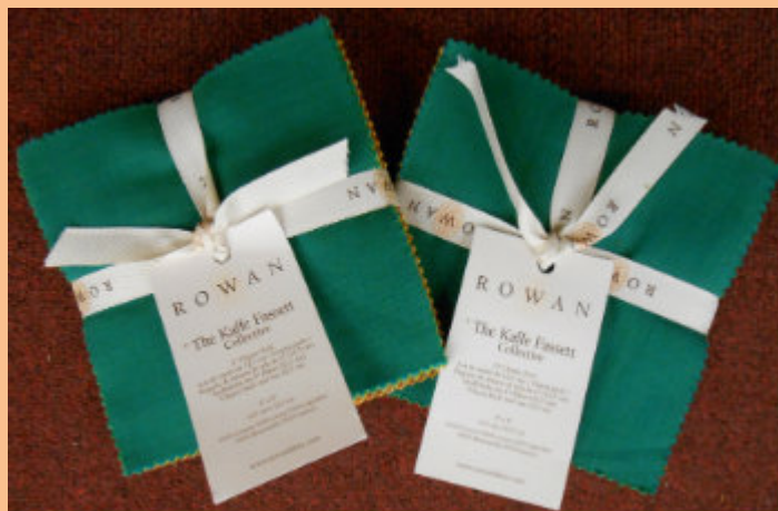
The Kaffe Fassett Collective by Rowan